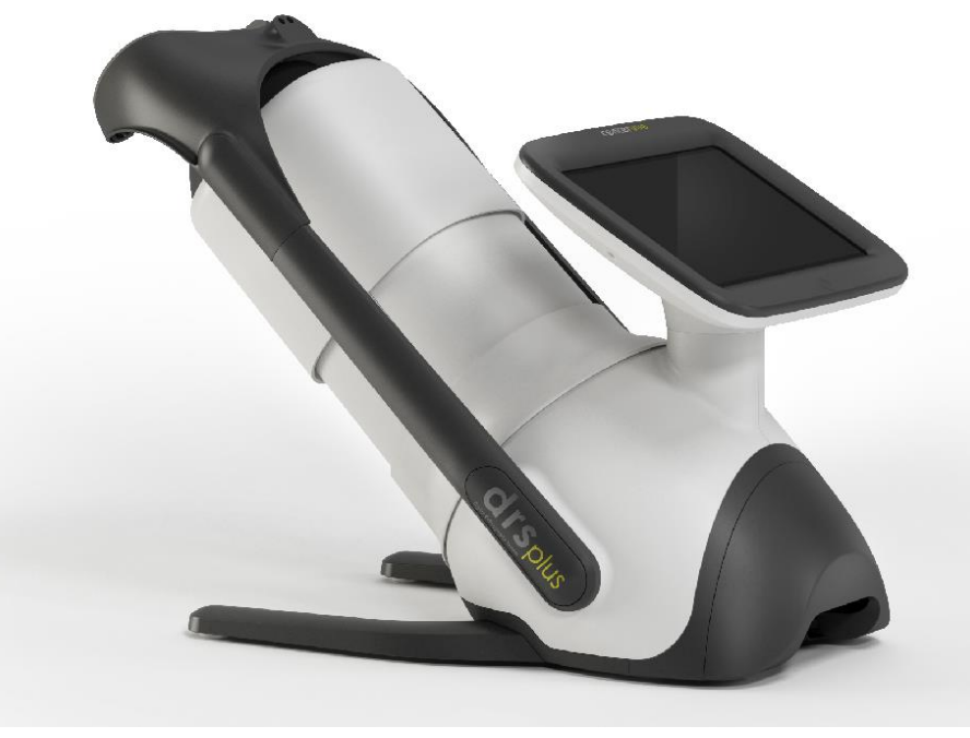
Fig. 1 – DRSplus device

Direct the subject being tested not to speak when placed in front of the device