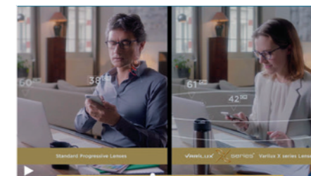
Show a simulation of personalized lenses