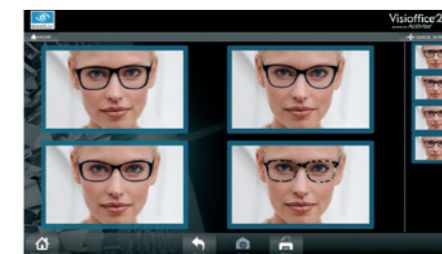
Making frame selection easier