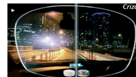
The benefits of premium lenses