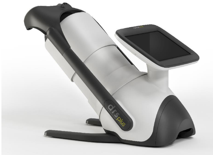
Fig. 1 – DRSplus device