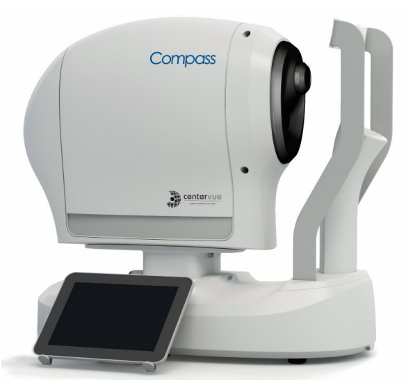
Fig. 1 – COMPASS device