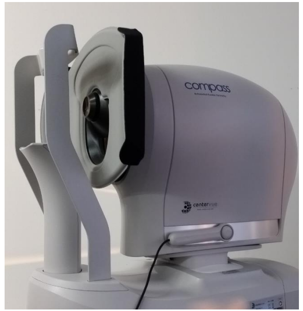
Fig. 3 – Magnetic hood