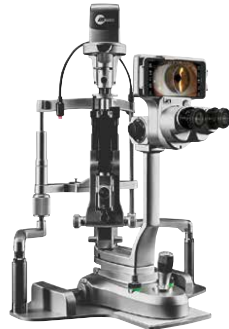
Ultra M5 Series Slit Lamp Integrated connections for digital imaging systems. (Marco ION IMAGING SM shown)

A system that you will want in every exam room, not missing the opportunity to capture, integrate and educate every diagnosis.